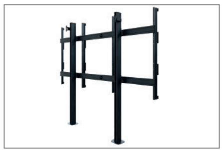
No fine adjustment necessary

In addition to the pre-configured systems, HAGOR offers customised special solutions in the LED sector, which can be individualised with accessories such as loudspeakers, controls and so on to meet all requirements.