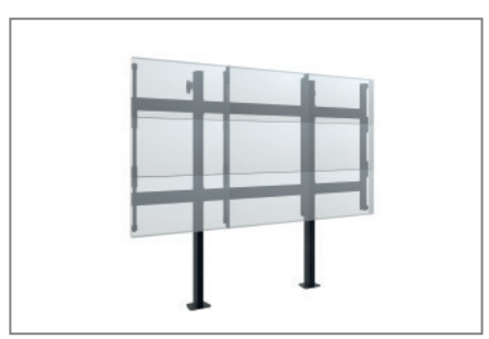
Low space requirement thanks to floor-wall mounting