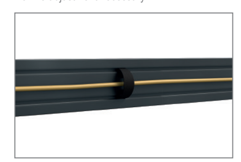
Cable routing with clips